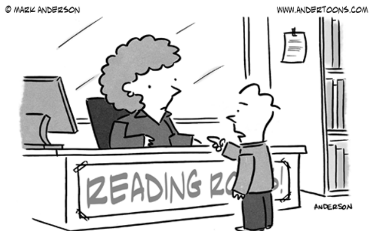
"Decimals are OK I guess, but there better not be a Dewey fraction system."

(These urls are just a click away on your email version of the handbook!)